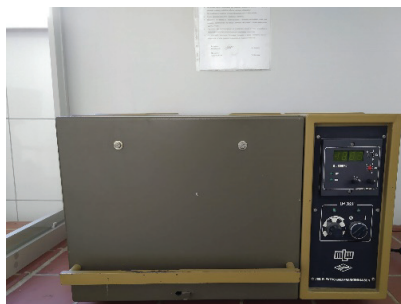
Fig. 4. Muffle furnace (Germany)

The pH value of the meat was determined using a digital pH meter pH-150MI ( Fig. 5 ) according to the method [11]. PH measurements were performed after 30 min of exposure.