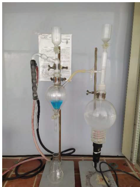
Fig. 2. Kjeldahl apparatus (Germany)