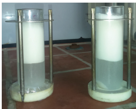
Fig. 7. Stratification of the emulsion at determining the emulsifying capacity

Minced meat plasticity is its ability to withstand a static load of the mass, reduced to a unit of mass (1 kg). The indicator was determined by the area of the minced meat stain, formed under the action of a static load weighing 1 kg for 10 minutes [14] and calculated by the formula: