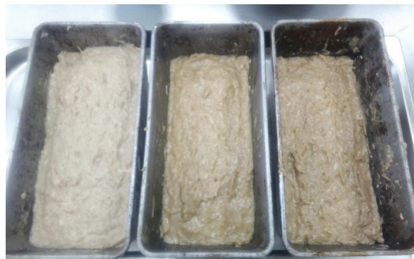
Fig. 1. Experimental model samples of minced meat before heat treatment (1, 2, 3)

Nutmeg pumpkin paste was made from purified pulp using a blender. Side lard was frozen and crushed into pieces measuring 3×3 mm. The crushed components were stirred for 8 minutes, salt and spices were added to the minced meat. After cooking, the minced mass was filled into pans, pre-greased with lard ( Fig. 1 ).