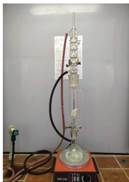
Fig. 3. Soxhlet apparatus (Czechia)

The mass fraction of ash was calculated by the formula, %.