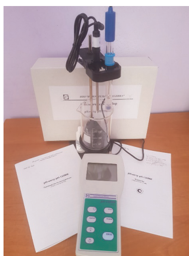
Fig. 5. Digital pH meter pH-150MI

The pH value of the meat was determined using a digital pH meter pH-150MI ( Fig. 5 ) according to the method [11]. PH measurements were performed after 30 min of exposure.